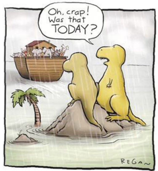
Ever Feel Like This?